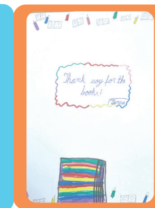
Scoala Puchenii Mari, Romania