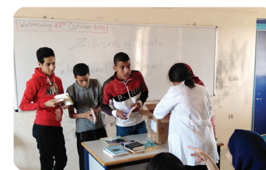
Lycée Collegial El Mouahidine, Morocco

Thoughtful thank-you notes and photos encourage us to keep moving forward. For many of our partners, the only books they have are provided by International Book Project. Hearing about the impact and seeing partners' smiles reminds us that books really do change lives.