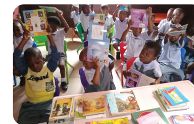
Mum's Care Project Asaba, Nigeria