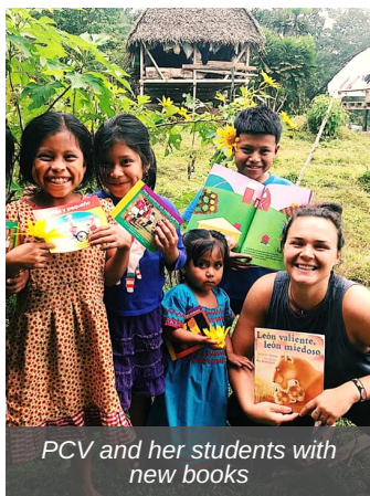
PCV and her students with new books

How one small town is building a library to support its youth