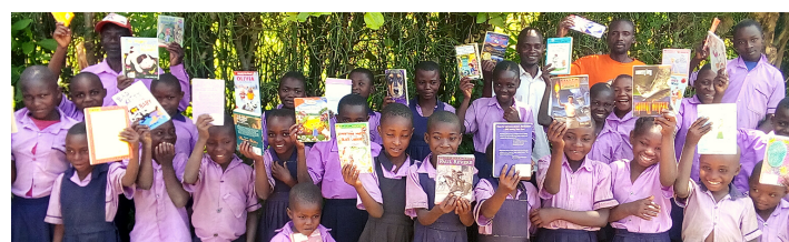
A secondary school in Uganda received a small shipment of 162 textbooks and library books. The headteacher stated, "The books sent get our school one step closer to a friendly reading environment, and for that I thank you."

- San Jose de Gracia Biblioteca Pública, Jalisco, Mexico