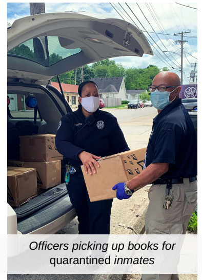
Officers picking up books for quarantined inmates

"That's the thing about books. They let you travel without moving your feet." - Jhumpa Lahiri