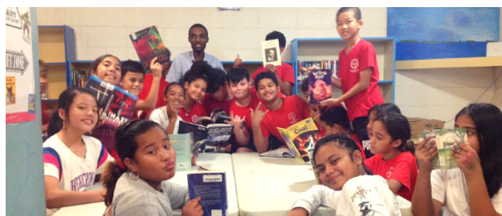
6th-grade students from the Marshall Islands received a small shipment with 80 library books. The teacher reported that "while it was a small shipment, it was a big step toward improving our resource base and will go a long way in helping us build our library!"

I wish it were possible to put into words just how much this gift truly means. Please believe me when I speak on behalf of the students, administration, and myself and say this gift will truly do great things and benefit many people both in our school and community.