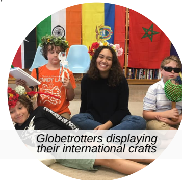
Globetrotters displaying their international crafts

Pending COVID-19 developments, International Book Project is planning to continue its free kids' summer program, Globetrotters, for the second consecutive year. Throughout the week, 4th and 5th graders will be transported across the globe through food tastings, music, dance, arts and crafts, and storytelling-- all without leaving IBP's warehouse. From painting vibrant mosaics in Morocco, to sampling delicious pierogies in Ukraine, students will learn about the multicultural world we reside in. While "traveling", each student will use their makeshift passport to collect customs stamps and their world atlas to understand the relative distance they journeyed. By the end of the five-day camp, our "globetrotters" will have acquired an increased understanding of cross-cultural awareness, developed a better sense of geographic location, and learned how unique cultures coexist in our interconnected world.