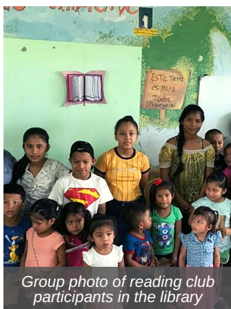
Group photo of reading club participants in the library

OF STUDENTS passed the basic skills test issued by the government