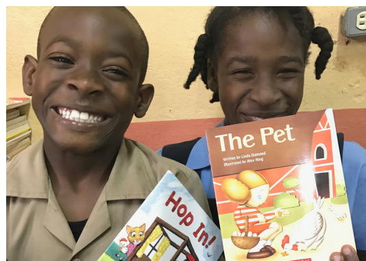
Pallet partner in Jamaica received 3,066 children's books