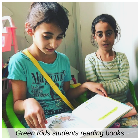
Green Kids students reading books

"...feed the dreams of children through books."