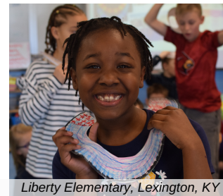
Liberty Elementary, Lexington, KY

By the end of the year, students learned that the immediacy of instant messaging cannot replace a physical letter that traveled thousands of miles before finally reaching its destination. International Book Project is endlessly proud of the new friendships, geographic diversity, and academic strides that marked this year's Books as Bridges group.