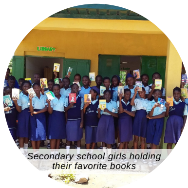
Secondary school girls holding their favorite books

in the literacy rate between men and women in Nigeria