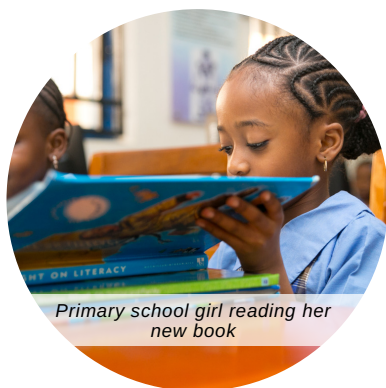
Primary school girl reading her new book

The impact one shipment can have on a generation of students