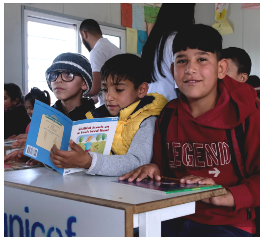
Syrian children at Qushtapa refugee camp

Green Kids initiated several programs, including building libraries, opening art rooms, and teaching environmental education classes. To help fill their libraries, International Book Project shipped 63 boxes with more than 5,000 children's books. Many of the books went to camps, but some of the more advanced science and reading books were relocated to larger schools and universities working with Green Kids. According to Morad, the shipment "will help the children to grow and connect with the magical world of books." The shipment included easy readers, elementary and middle school textbooks, and picture dictionaries to help students learn English. So far books have been distributed by Green Kids to an elementary school in the Slemani region, a university in Halabja, and to Syrian refugees at the Qushtapa camp, benefiting more than 3,000 students. We hope to grow our partnership with Green Kids in the future and "continue to feed the dreams of children through books." Reports and photos of smiling kids excitedly reading their new books are heartwarming and truly highlight the transformative, life-changing, power of literacy.