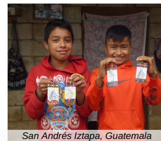
San Andrés Iztapa, Guatemala